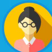
Business dev. managers