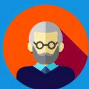
Senior decision makers

Our 400 attendees will be directors, managers & leaders looking to recruit, retain & develop talent within their organisations to drive business improvement & growth