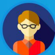
Training decision makers